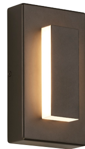
ASPEN 8 shown in bronze