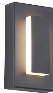
ASPEN 8 shown in charcoal

* Visit techlighting.com for specific warranty limitations and details.