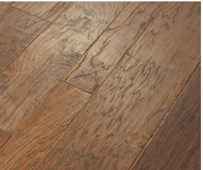
2000 Pacific Crest