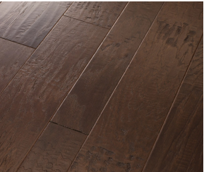
941 Three Rivers