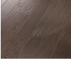
5003 Crystal Cave