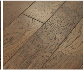
2000 Pacific Crest