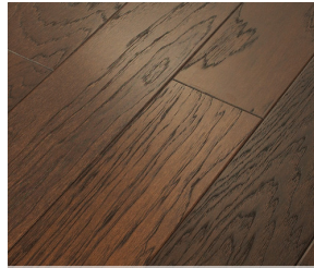
941 Three Rivers