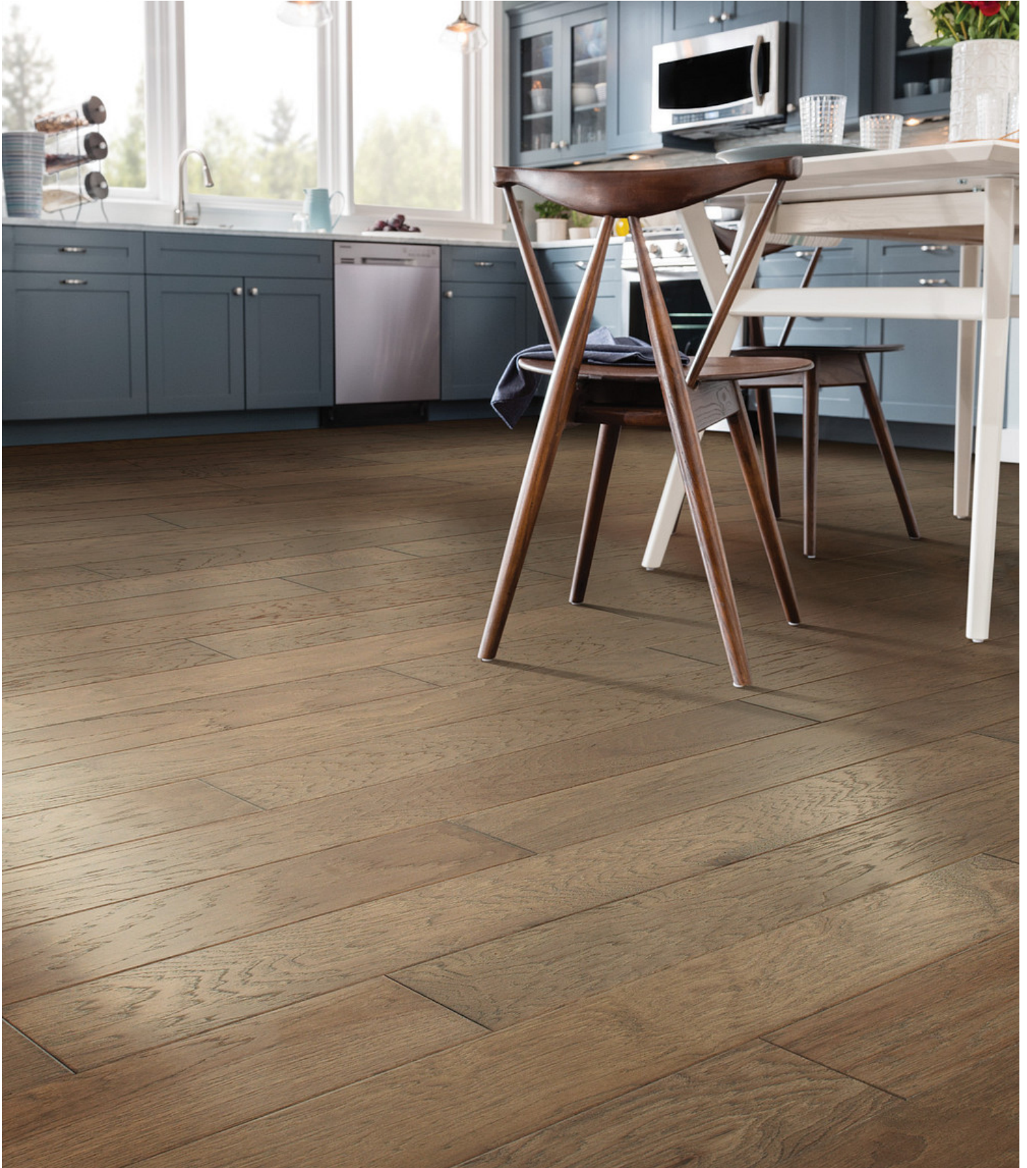
2000 Pacific Crest shawfloors.com