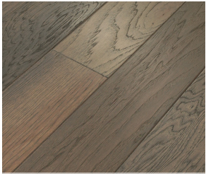
5003 Crystal Cave