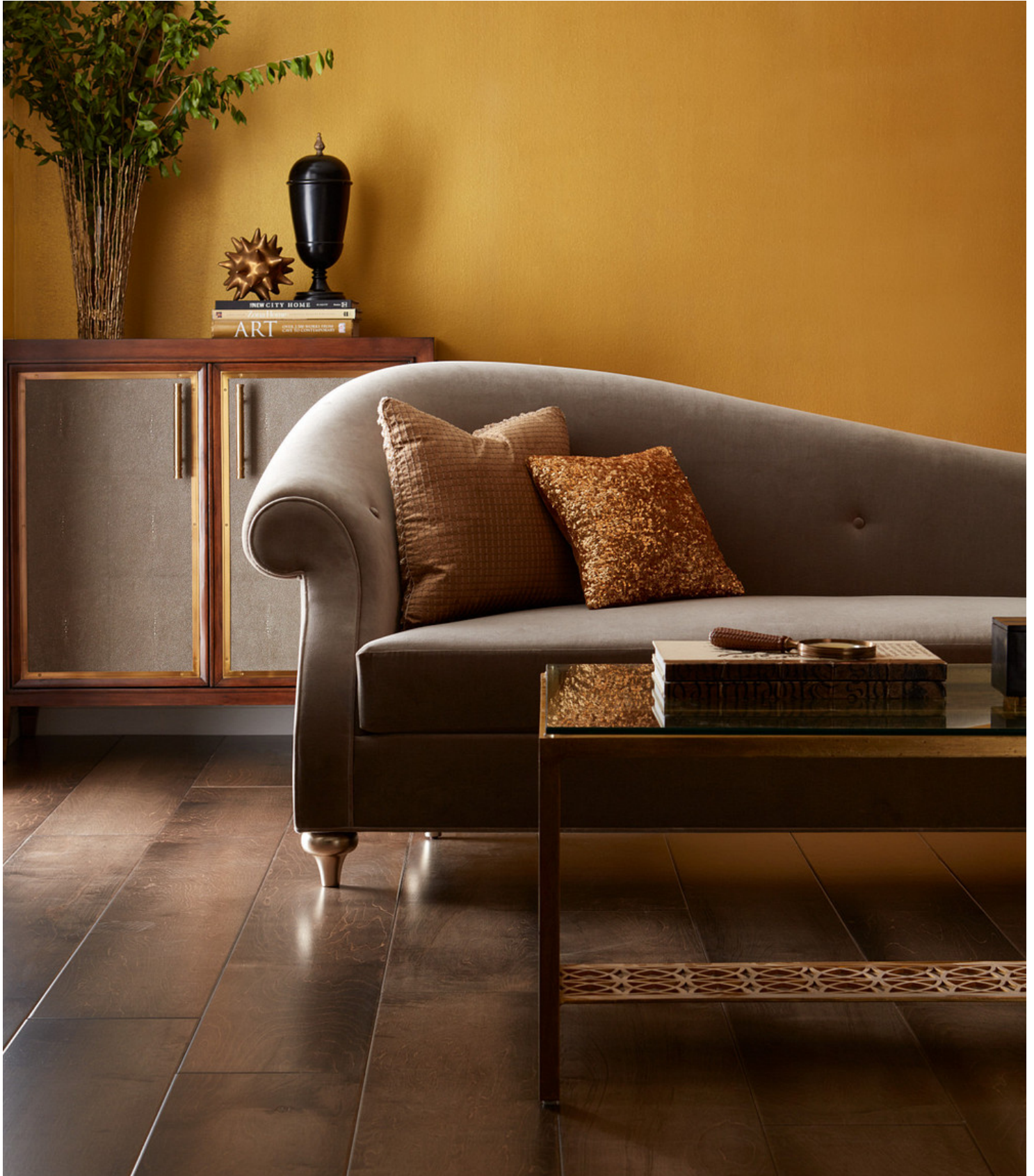
5023 Mount Rushmore shawfloors.com