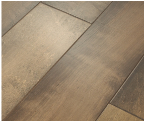
1012 Independence Hall