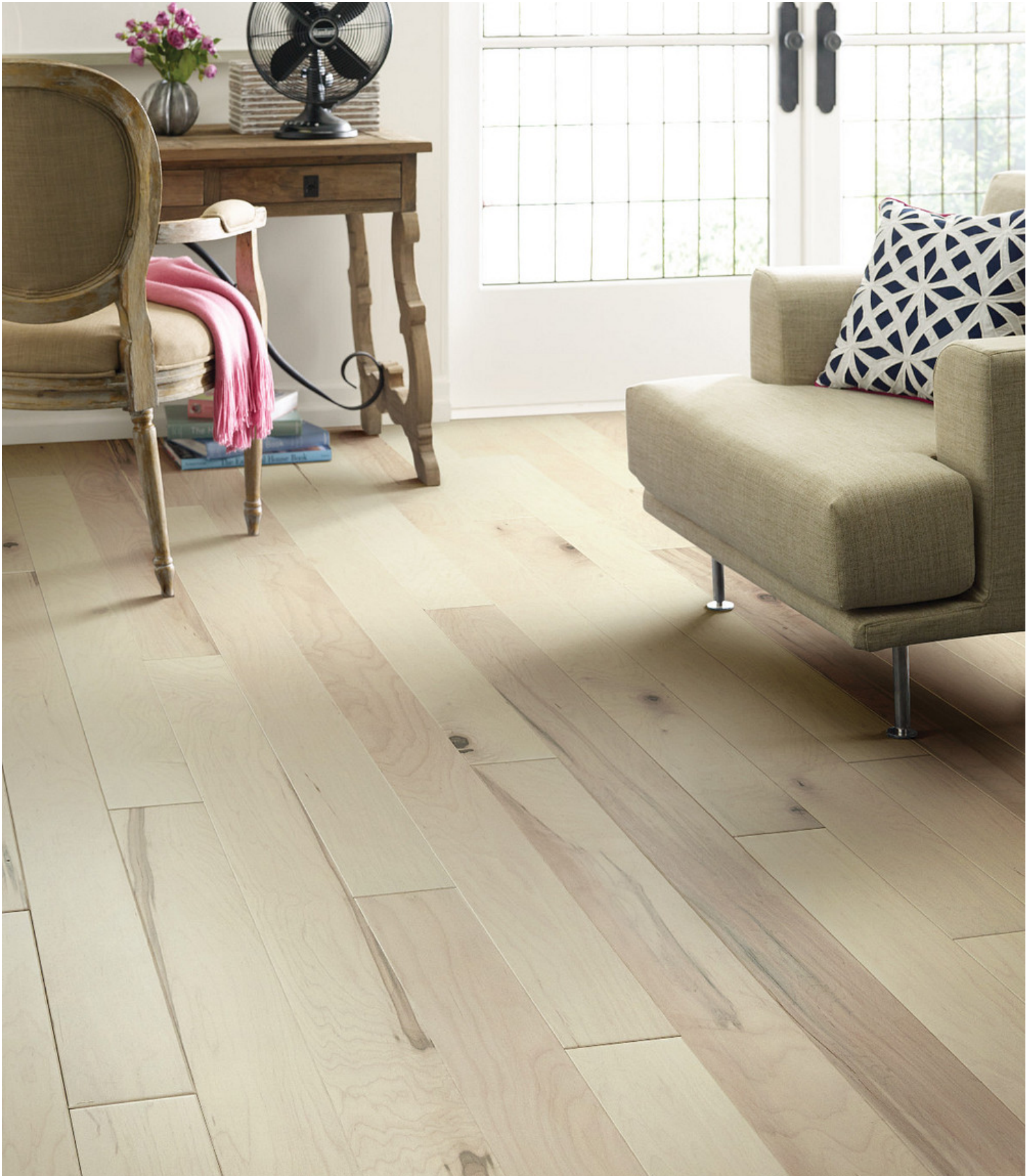
1041 Americana shawfloors.com