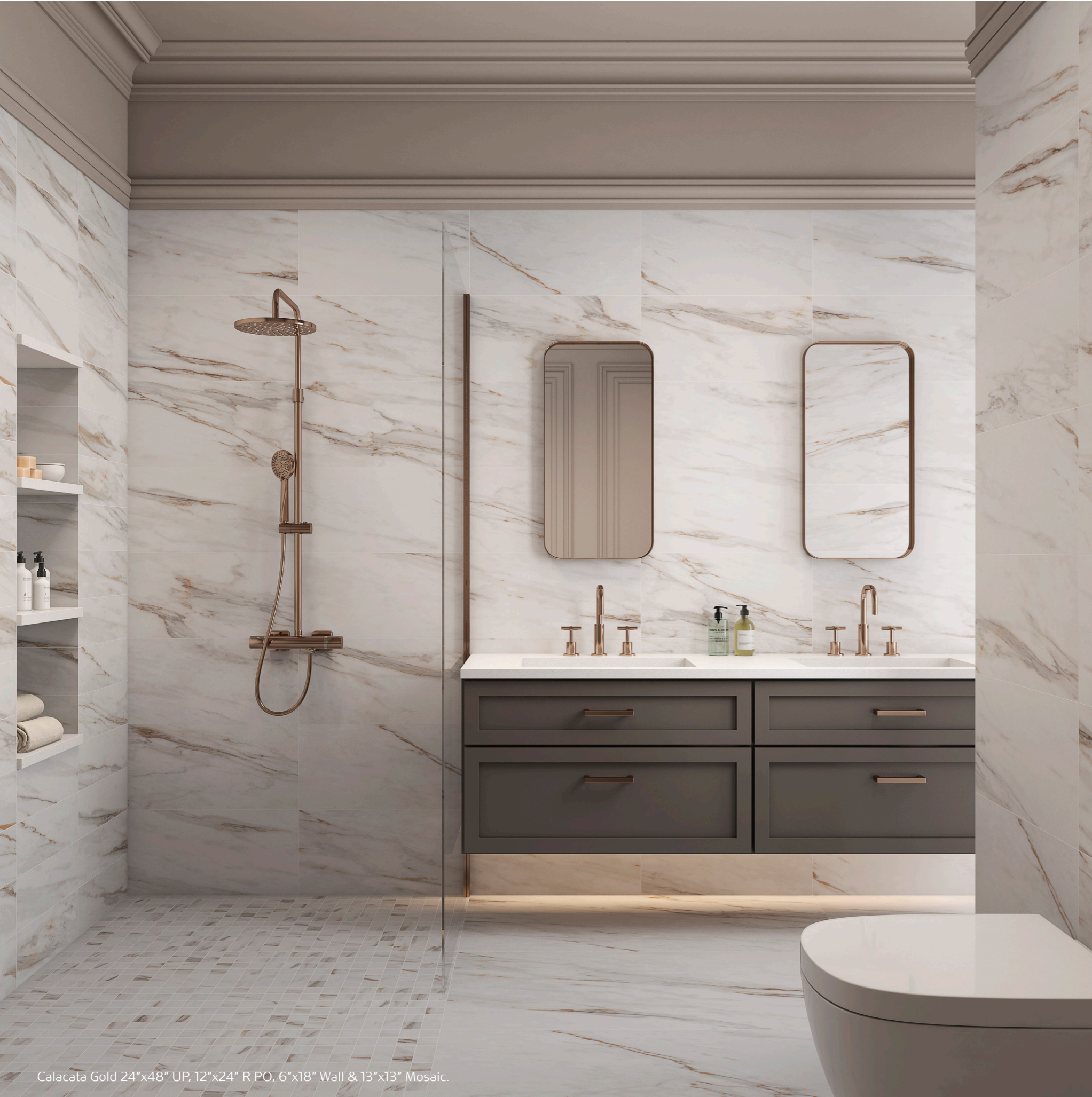
Calacata Gold 24"x48" UP, 12"x24" R PO, 6"x18" Wall & 13"x13" Mosaic.

The Calacata Gold generates unique atmospheres and bright spaces offering a balance between the matte and polished finishes. Also adding warmth through its gold veining, making way for versatile combinations of elements.